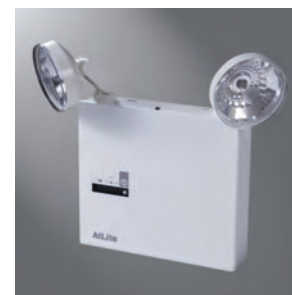
A COMMERCIAL EMERGENCY LIGHT